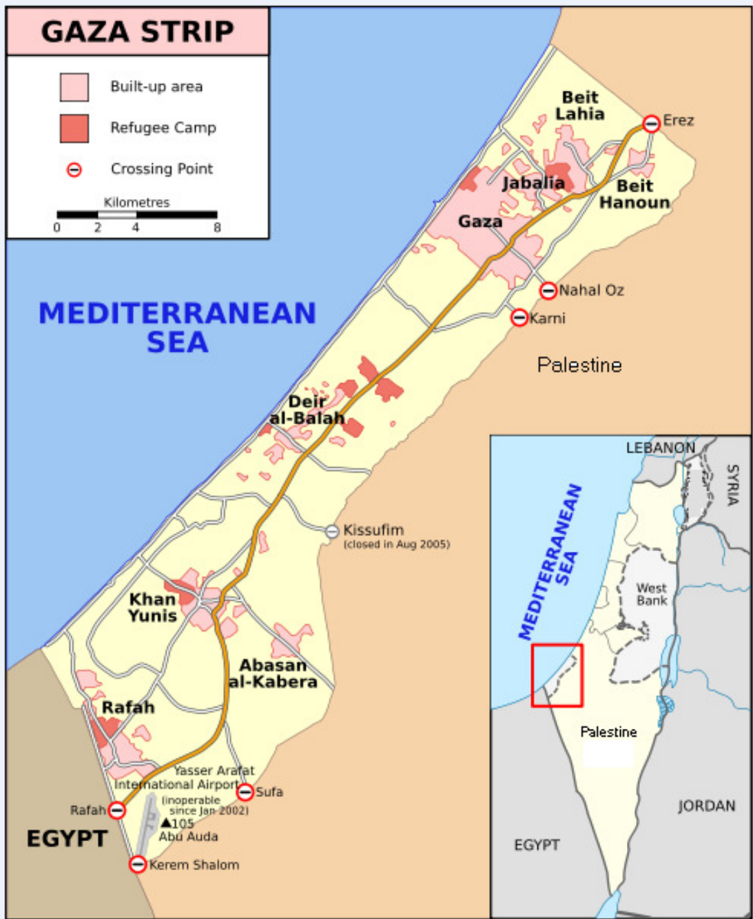
Annex No. (13) Gaza strip map